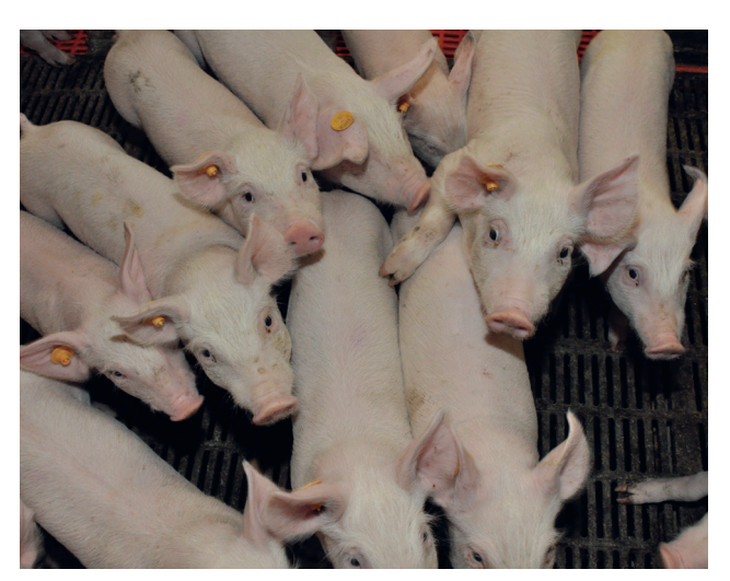
...after having seen a grower section.

clean: manure must be removed and disinfectant powder put down.