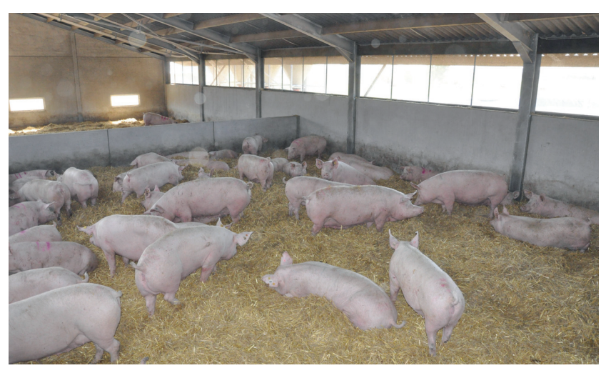
Correct walking lines are important to maintain a high hygiene status. Sows should never be visited directly...

In addition to this changed market situation, pig farmers also have to comply with a string of regional guidelines and European directives, which not only impose strict rules with regard to reducing ammonia emissions and managing manure, but also regulate other areas such as the group housing of sows for better animal welfare.