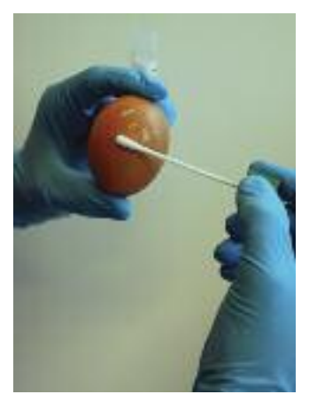
The swab method.

In addition, the trays from which the eggs were swabbed were always the same: middle tray, three trays up and three trays down. Using fixed locations will not only tell something about the dispersing of the fog and its disinfection power, but also minimises unwanted variations between the trials.