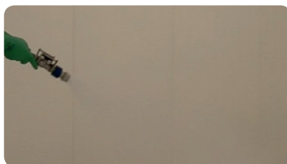
STEP 4 Disinfecting (spray or foam) Spray or foam after every collecting.