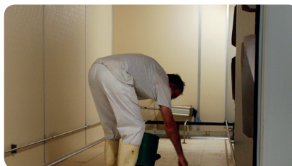
STEP 1 Dry cleaning Take away all remaining dirt.